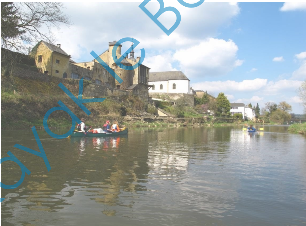
The Semois approaching Chassepierre, another major highlight of this route.