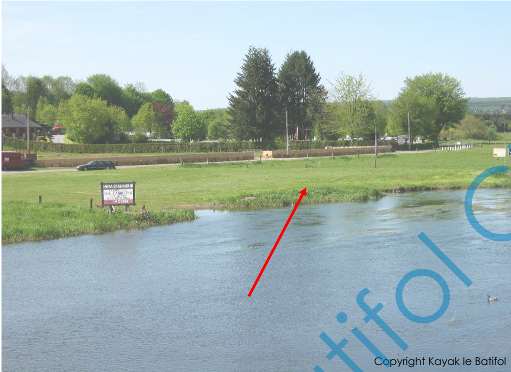
Landing point in Chassepierre, near Camping Les Cabrettes.