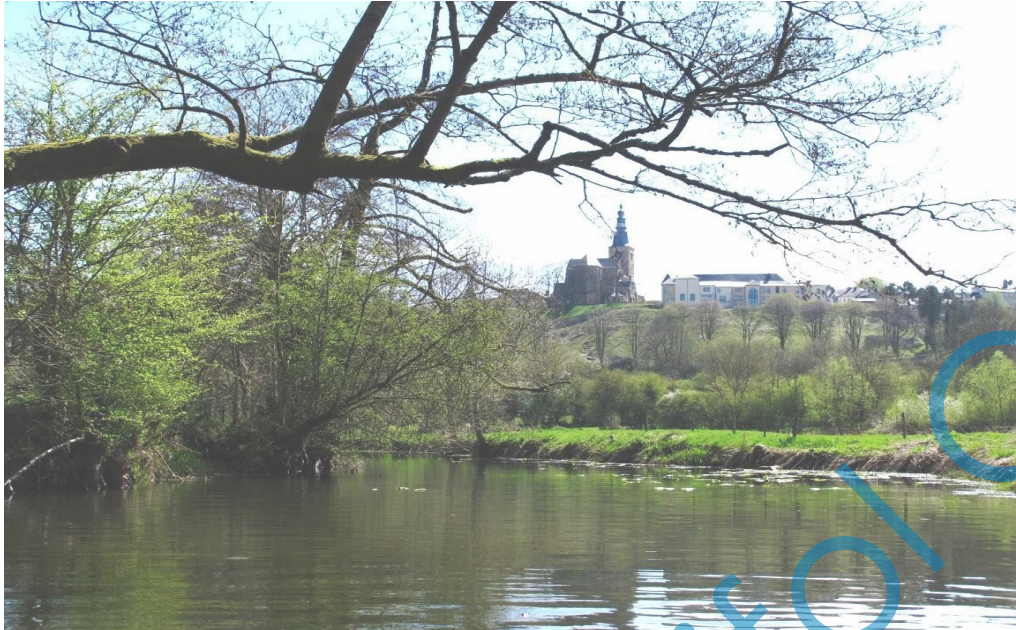
The Semois in Florenville.